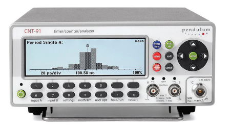
Figure 6: The same result as in Figure 5, now displayed as a histogram.